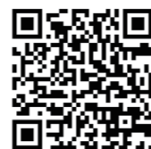
Overview of KU by foreign student